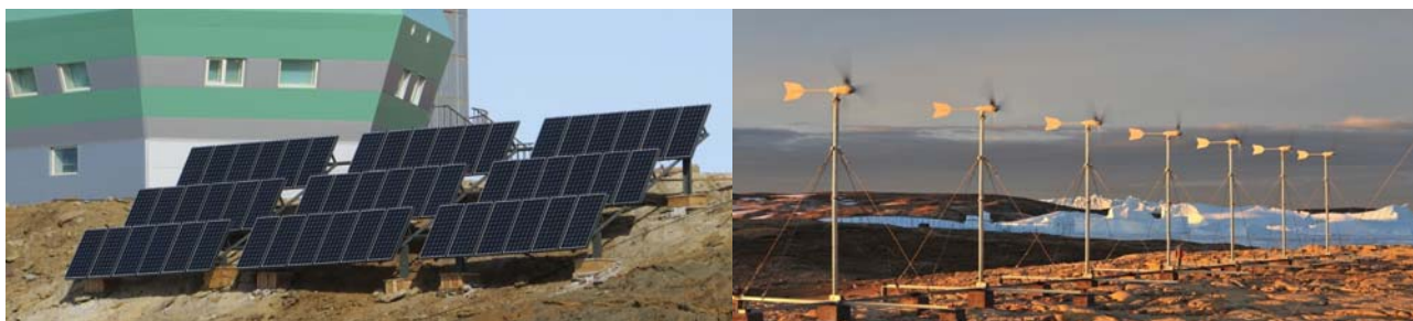
10 kW Solar PVs (left) and 21kW Wind Power Plants (right) in Operation at Zhong Shan Station (Photo: PRIC)

(Dr. Chen Bo, PRIC / chen-bo@pric.org.cn)