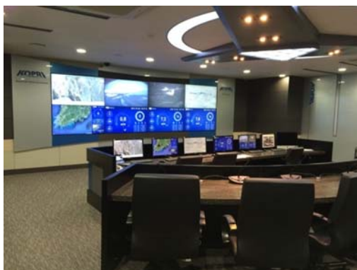
KOPRI Operation Center

tions, providing a display of key information and locally captured images.